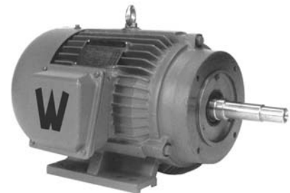
Close Coupled Pump Motors