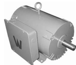
Single-Phase T-Frame Motors