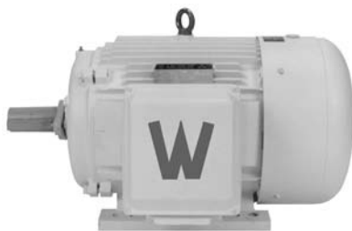
Oil Well Pump Motors