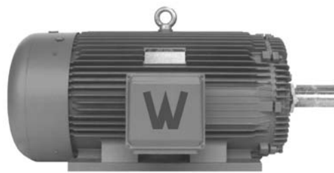
Rock Crusher Motors