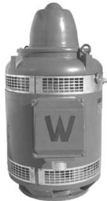
Vertical Hollow Shaft Motors