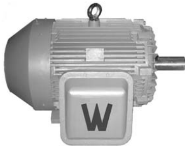
Explosion Proof Motors